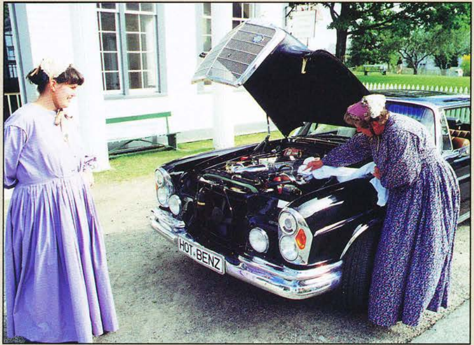
Nova Scotian pit crew members service the 6.3 Coupe in Sherwood.

At Balancing Rock Park we took the 1 1/2-mi trail to the beach then headed back to Digby and Route 1 south toward Comeauville. Driving through a rural area, in a village we suddenly saw a huge cathedral. Eglise Saint Bernard was built in 1910 and finished in 1942. Before Yarmouth we stopped at a tiny chapel right on the road—just five pews and an altar. We sat and let our thoughts drift a bit then continued to Barrington and on Route 103 to Shelburne, a