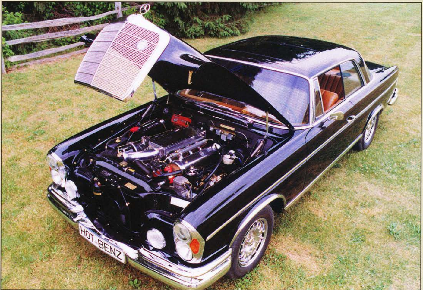
A 300SE Coupe is a fair match for a 6.3 engine because it has air suspension; you might say it's the car that DBAG should have built alongside the 300SEL 6.3 sedan.

ferry; above the landing is the cemetery where the Nova Scotia Giant was put to rest. The coastline drive up to Ingonish and the highlands is unforgettable for its beauty.