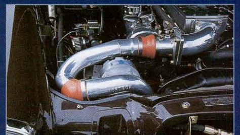
If your 6.3 or 600 just isn’t already powerful enough, Karl’s supercharger kit could well be the answer...