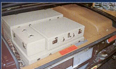
It’s not just mechanical parts Karl can help with; luggage and interior fittings are all part of the story.