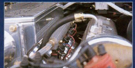
Modern software has been utilised in a new fuel management system Karl has developed for the M100.