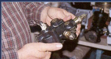
Any part that can be recovered from the wrecks is re-conditioned and added to Karl’s formidable stock.